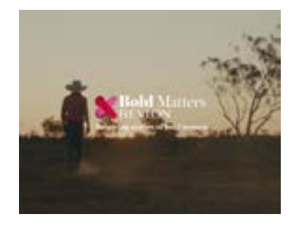
Launching the Revlon "Bold Matters' lipstick campaign focusing on important matters relevant to Australian Women