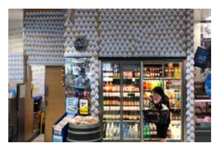
IGA Raindrop Appeal - nationwide campaign raises over $810,000